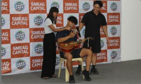
A heartfelt musical moment: Students share the spotlight, performing a song together and showcasing their musical talents, bringing the audience closer through the universal language of music.

The stage came alive as students stepped out of their comfort zones to showcase their hidden talents. From soulful musical performances to high-energy dance routines, these moments highlighted the vibrant personalities and creativity that make our community so unique. It was a beautiful display of confidence, proving that learning at SMEAG goes far beyond textbooks.