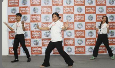
Energy in motion: Students take the stage to perform an upbeat dance routine, reflecting the high spirits, confidence, and vibrant energy of the SMEAG community during the event.